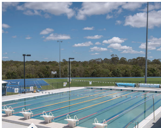
25 metre, 8 lane heated swimming pool with grandstand