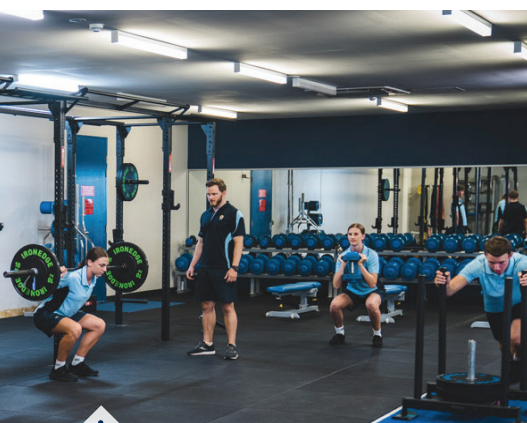
Spacious, air-conditioned Fitness Centre (Gym)