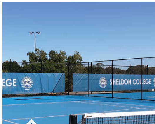
6 world-class LED floodlit hard tennis courts