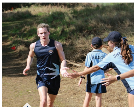
Cross Country Course (2km): in tranquil bushland setting