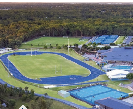
World-class sporting facilities across an expansive College campus.

Discover Sheldon College VIRTUAL TOUR sheldoncollege.com/vt