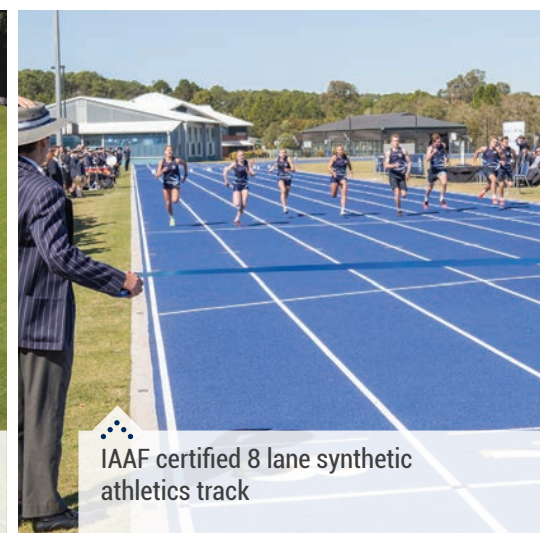
IAAF certified 8 lane synthetic athletics track