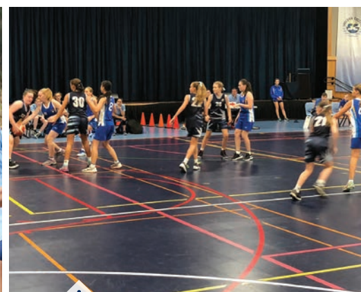
Indoor Sports Centre: designed for multi-sport use